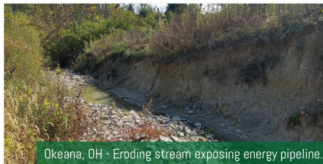
Okeana, OH - Eroding stream exposing energy pipeline.

In a financially conscious industry, Flexamat® provides a cost effective solution. Many of these sites are in remote locations where shipping large quantities of material is difficult. A single truck can ship 4800 square feet of Flexamat® . This is a significant saving for sites off rural roads. Construction and maintenance crews of energy companies are easily and effectively able to install Flexamat® .