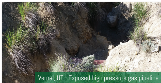
Vernal, UT - Exposed high pressure gas pipeline.