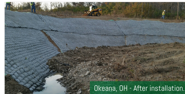
Okeana, OH - After installation.